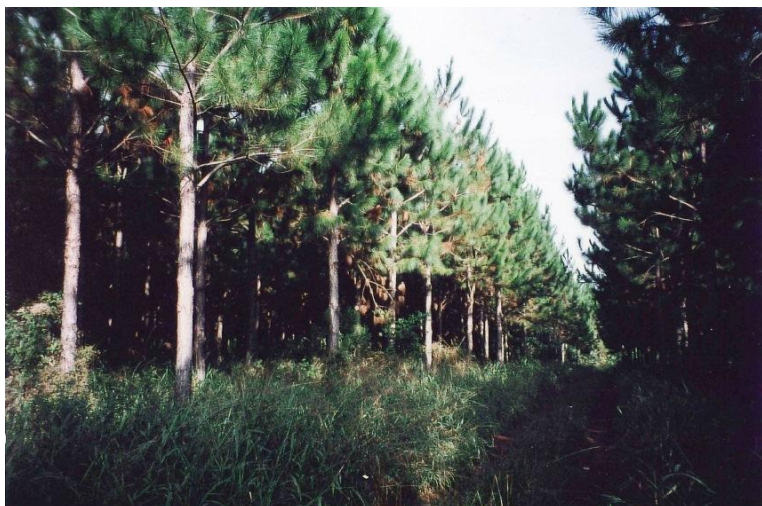
Provincia de Misiones / Pin plantation 10 years' growth